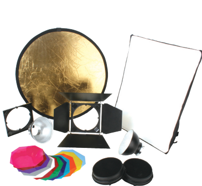
BW6660 Fashion Reflector Kit

advanced reflector kit The advanced Lighting Reflector Kit covers a broad range of lighting scenarios.