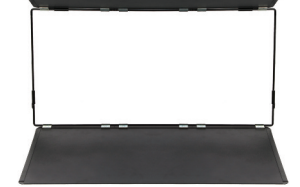
2x1 Panel Barn-Door Set

A set of two-leaf barn-doors (top and bottom) for use with two joined Mosaic units.