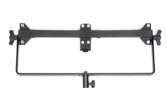
2x1 Panel Joining Kit

For joining two Mosaic units together. Includes joining plate and an extended swivel/tilt yoke.