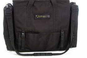
2 Panel Padded Carry Case

Padded Bag for 1 or 2 Mosaic panels plus filters, barndoors, batteries and cables. Light stands can be strapped to the front of the bag using the tie straps to create a portable and lightweight 2-light shooting kit. VB1525 2 Panel Padded Carry Case