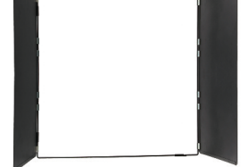
2x2 Panel Barn-Door Set

A set of two-leaf barn-doors (top, bottom or sides) for use with four joined Mosaic units.