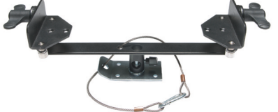
Ceiling Mounting Kit

For mounting a single Mosaic unit directly to a ceiling or other flat surface.