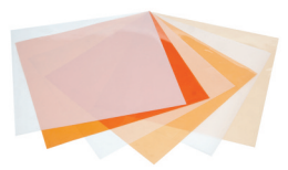
Colour Control Filter Set

A set of 6 filters for adjusting the intensity or colour temperature of the light output.