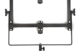
2x2 Panel Joining Kit

For joining four Mosaic units together. Includes joining plates and a larger swivel/tilt yoke.