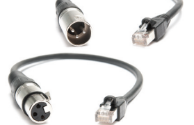
3 Pin XLR-RJ45 Adaptor

For Converting a DMX 3 pin Male or Female XLR plug to an RJ45 male plug.