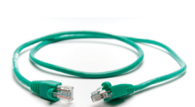
DMX / Ethernet Cable

DMX / Ethernet cable for linking mosaic units together to form light banks or chains.