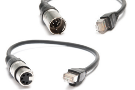
5 Pin XLR-RJ45 Adaptor

For Converting a DMX 5 pin Male or Female XLR plug to an RJ45 male plug.