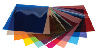
Colour Control FX Set

A set of 10 filters for adding colour or cosmetic effects to the light output.