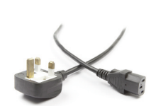
AC Power Cord

6m power cord for use with the AC/DC Adaptor Power Supply Unit.