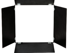
Mosaic Barn-Door Set

A set of four-leaf barn-doors (top, bottom and sides) for use with a single Mosaic unit.